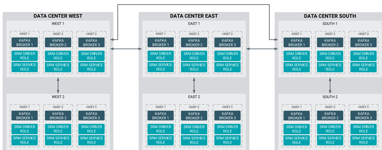
Figure 2: Cross Data Center Replication of Multiple Clusters

This example demonstrates the steps required to configure the deployment shown below. Additionally, it provides example commands that start bidirectional replication of all topics within each data center as well as example commands that replicate a single topic across all data centers